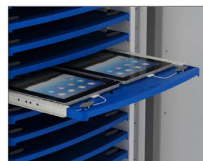
Colourful sliding trays with cable clips