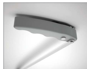
Concealed back door release