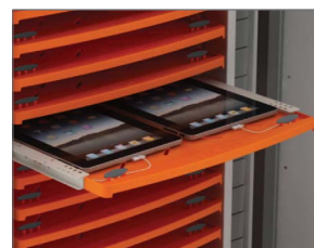
Colourful sliding trays with cable clips