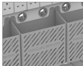
Individual pockets for cables and AC adapters