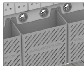
Individual pockets for cables and AC adapters