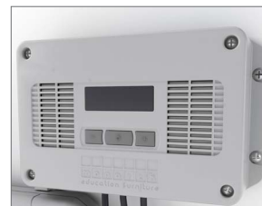
Power7 Energy Management System adapters