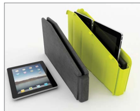
iPad converter kit for LapCabby Minis