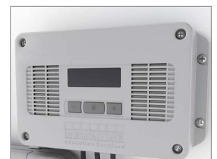
Power7 Energy Management System adapters