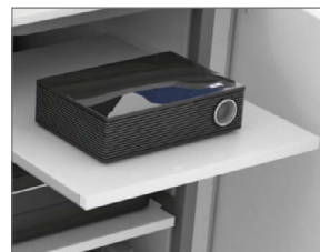
Sliding shelf for projector or printer